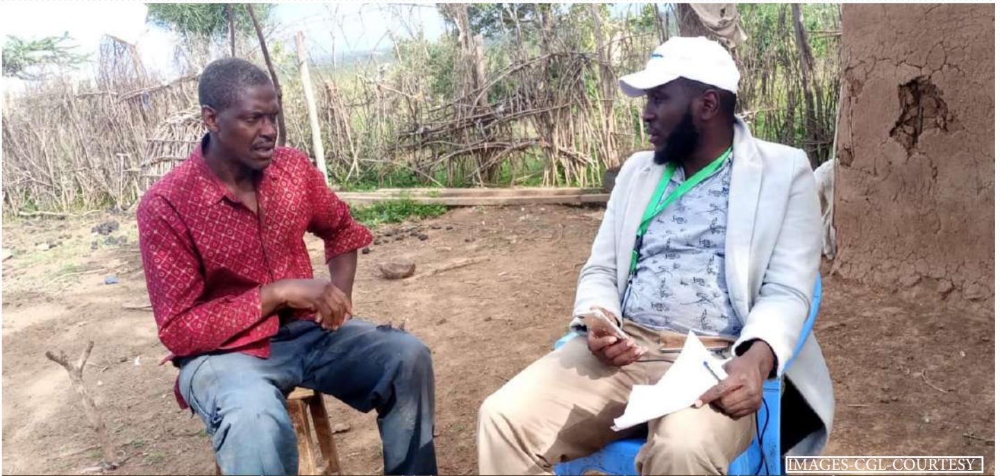
An interviewer conducting the survey in Doldol, trying to understand the resident's source of energy.

E arly October, the County Directorate of Energy, in collaboration with CARITAS launched a project dubbed Sustainable Energy Technical Assistance, SETA - designed and funded by national government, Ministry of Energy.