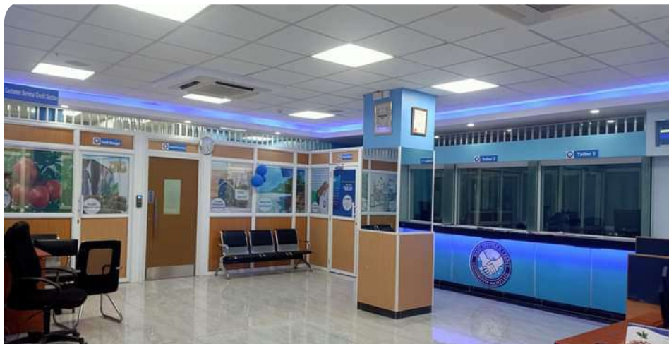
Siraji Sacco's ultramodern banking hall in Timau town

S iraji Sacco, a major partner with Laikipia County Revolving Fund through the Directorate of Cooperatives, recently opened an office block to serve its ever-growing members.