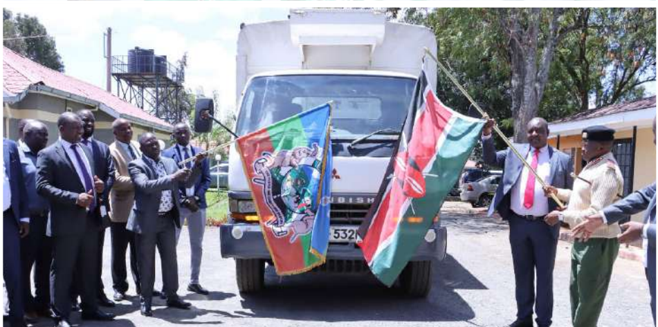
Governor Irungu and County Commissioner Mr. Joseph Kanyiri Flagging-off relief food in Nanyuki.