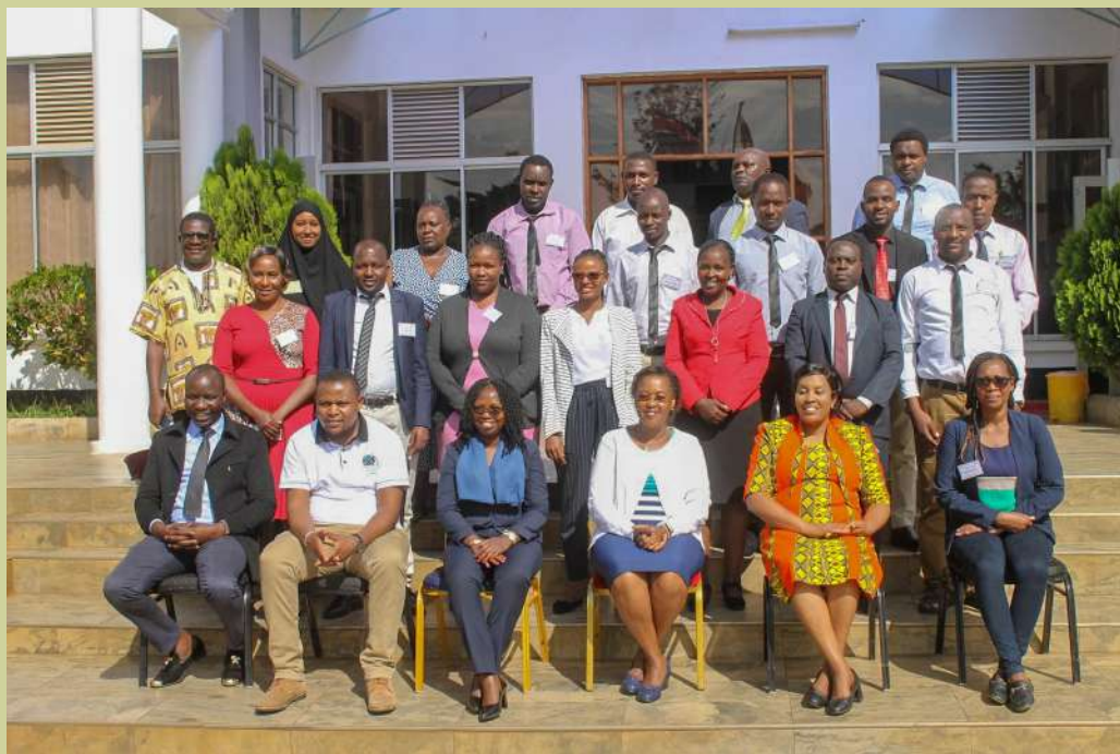
Staff members of the Laikipia County Revenue Board pose for a photo outside Kenya School of Government (Embu Campus) after a training session

This is the team that is the driving force that will help the county realise the Ksh. 1 billion target by the end of this financial year. Laikipia county has seen a steady growth in own source revenue since 2017. Thus, there is need to even train the staff behind