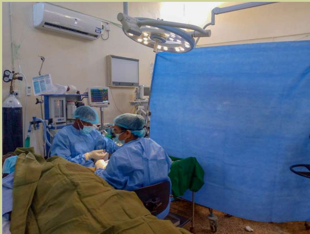
LHS Nanyuki Surgeons during a theater operation last year. The outlet has continued to broaden its investment in specialist care with the recruitment of specialist doctors