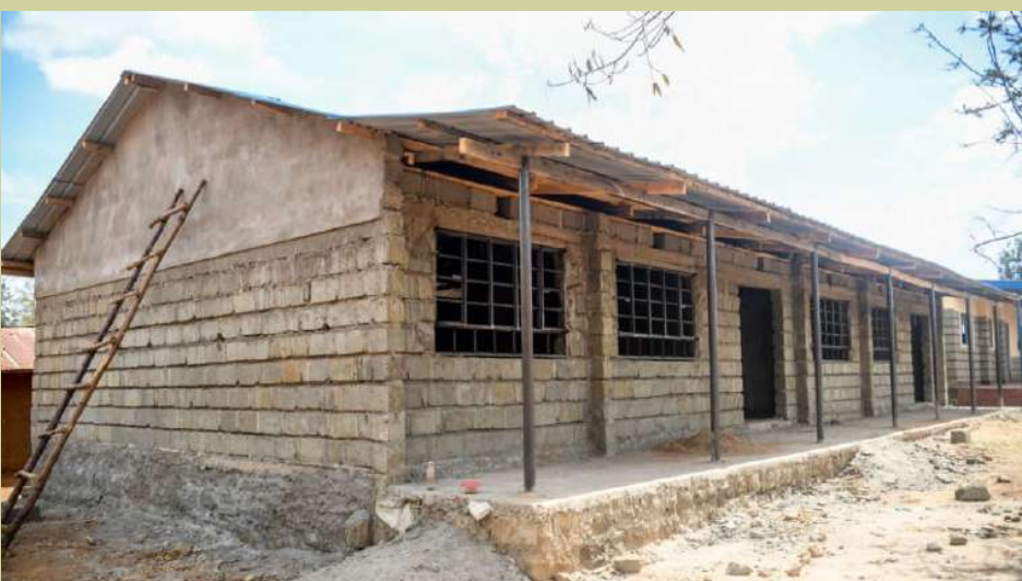
This block of classrooms at Merigwit is under construction by KDF

A group of Nyahururu business people have handed over the classroom they helped refurbished after it was destroyed by fire started by bandits several months ago. Teachers and pupils thanked the well wishers for the gesture. Meanwhile, school attendance in Olmorán stands at 85 percent.