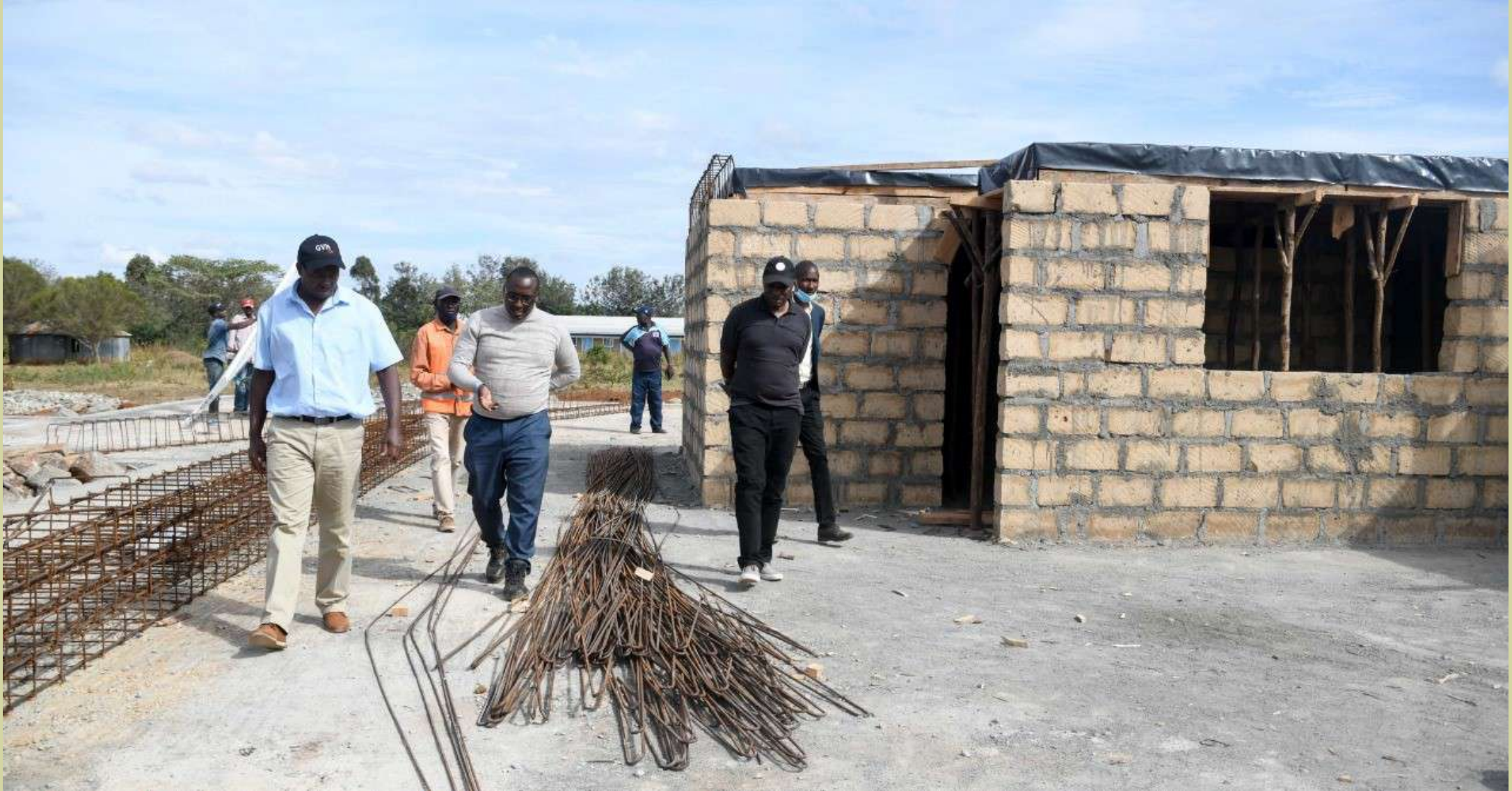
A modern police building coming up at Olmorán centre. The building will be ready by January 20, 2022

O l moran centre will have tarmac streets in the next few weeks as part of the ongoing Sipili-Olmoran road project. The first six kilometres from Mahiga primary school will have tarmac before Christmas.