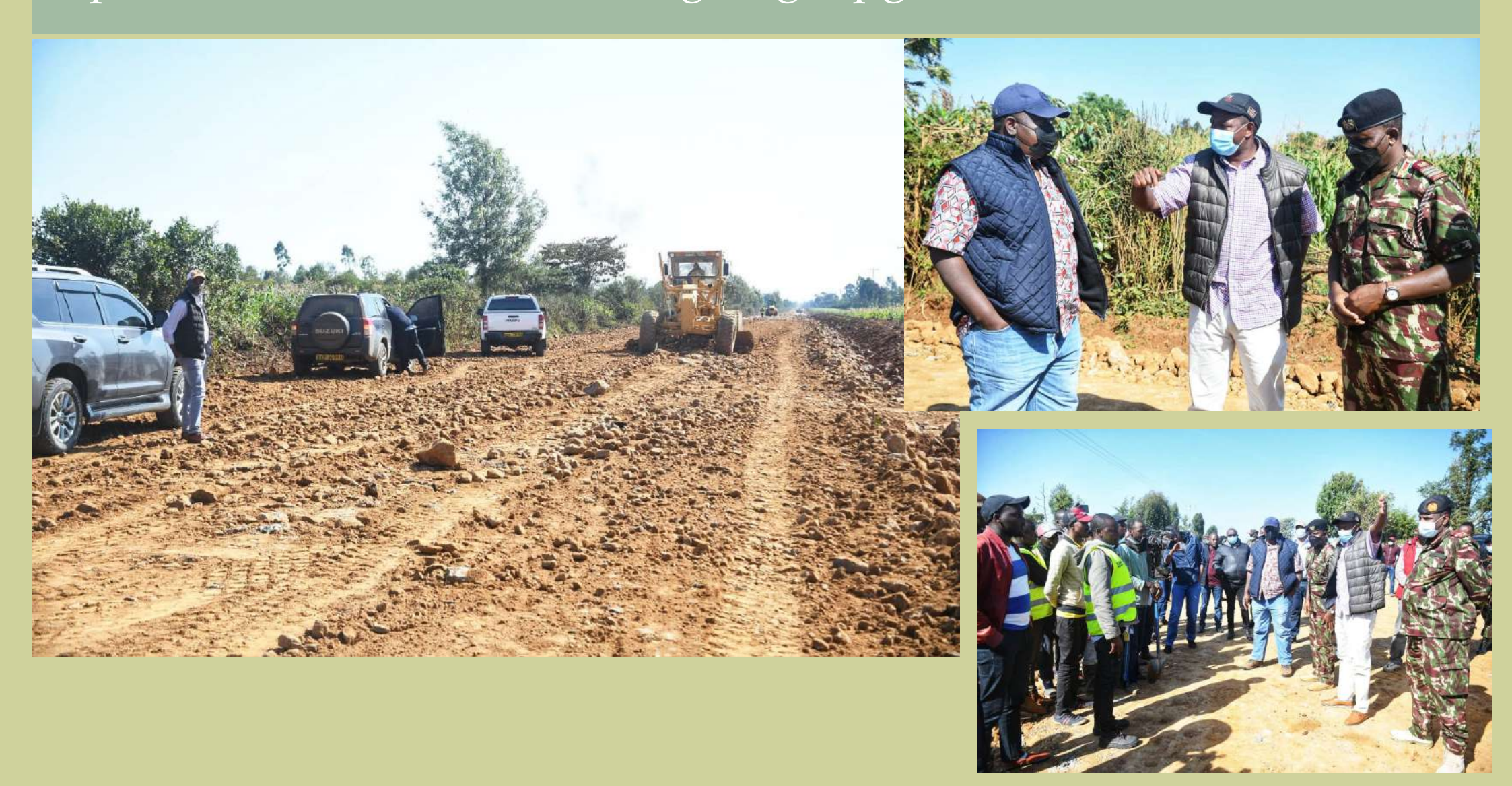
Leasing Programme is also Working on Ol Moran, Githiga and Sosian Roads