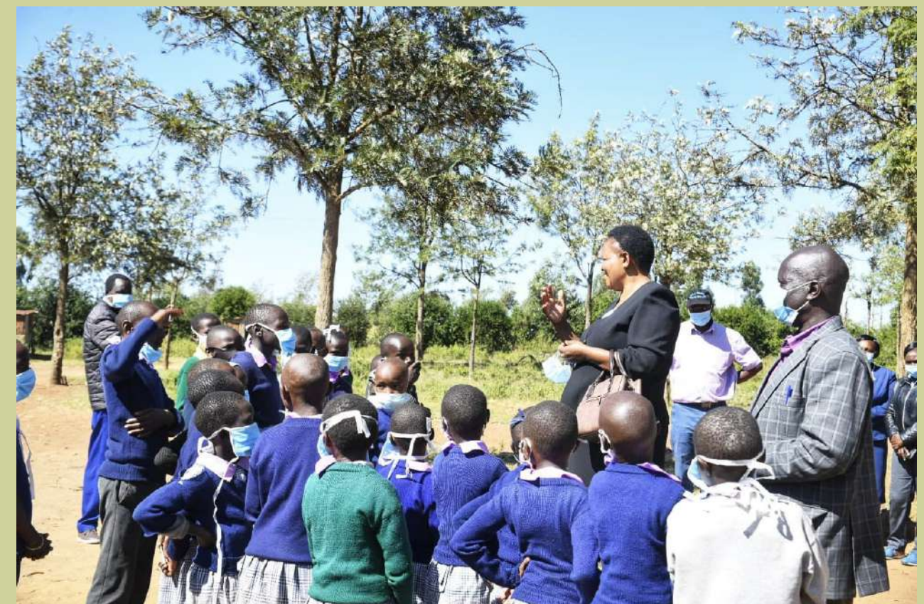
Governor Ndiritu Muriithi visited Ndunyu, Githima, Ol-Moran, Miharati Primary schools and Githima secondary schools. Enrolment will be higher tomorrow as parents confirmed there is adequate security now.