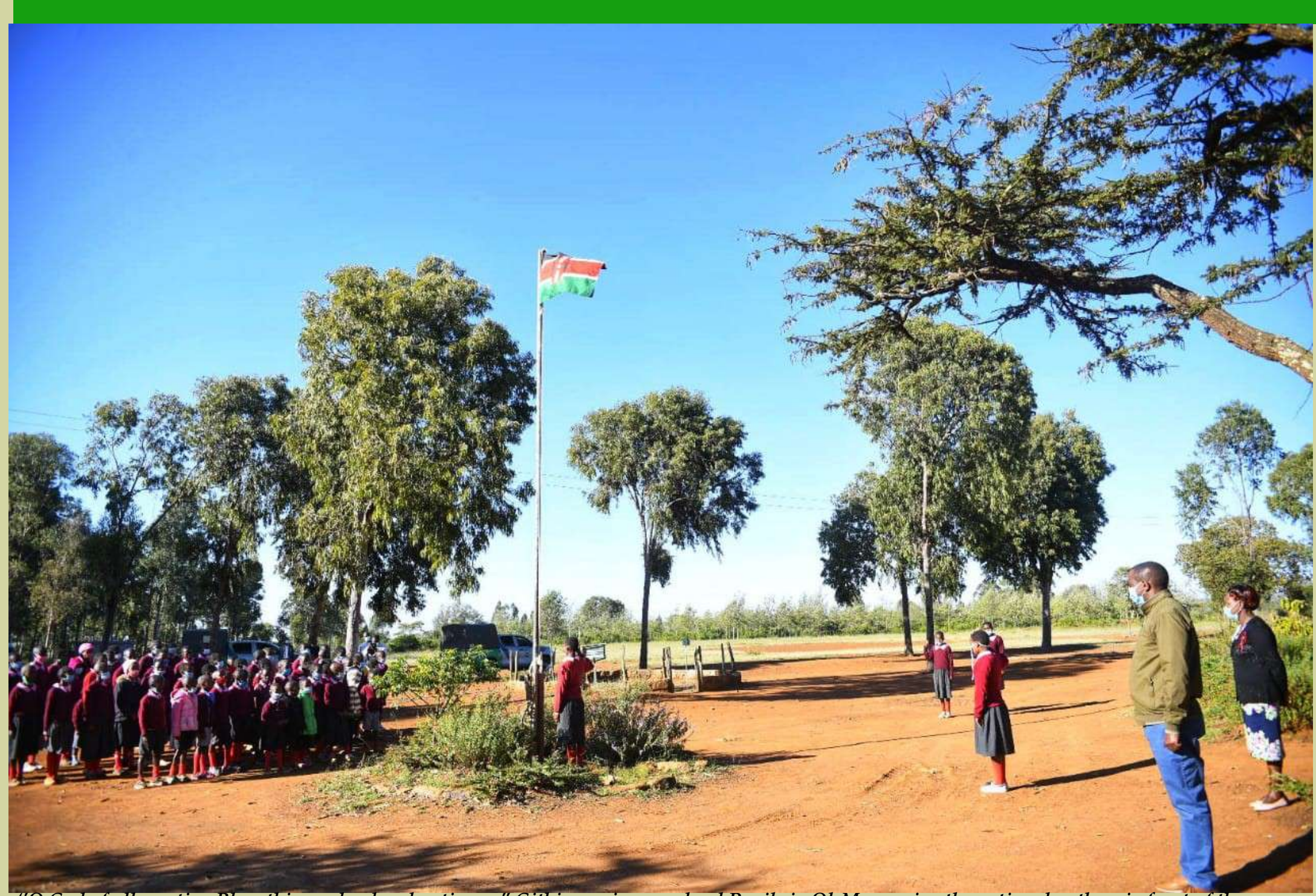
"O God of all creation Bless this our land and nation...." Githima primary school Pupils in Ol-Moran sing the national anthem in front of the national flag as school in the area reopened after they were closed last week due to insecurity. Pupils and teachers in Ol Moran need encouragement that