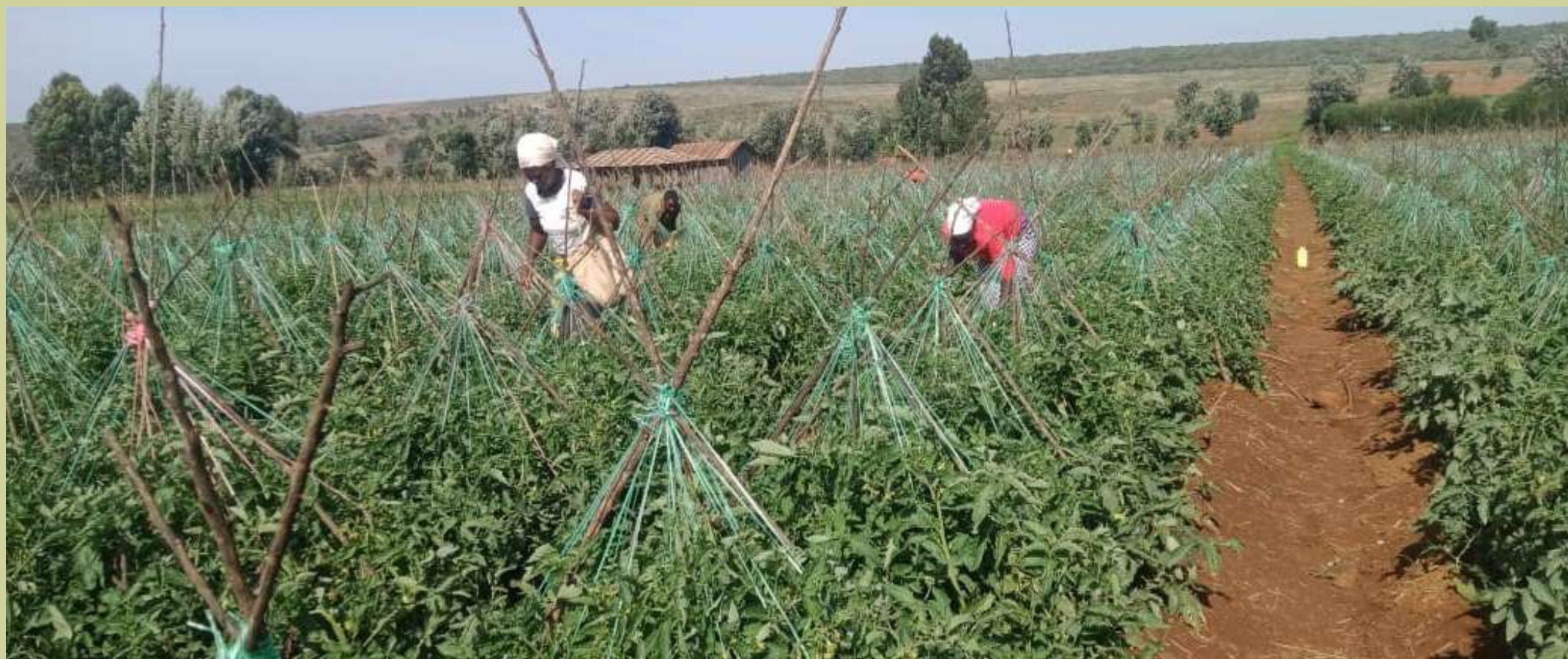
Farmers at Tomatoes farm in Ol-Moran ward