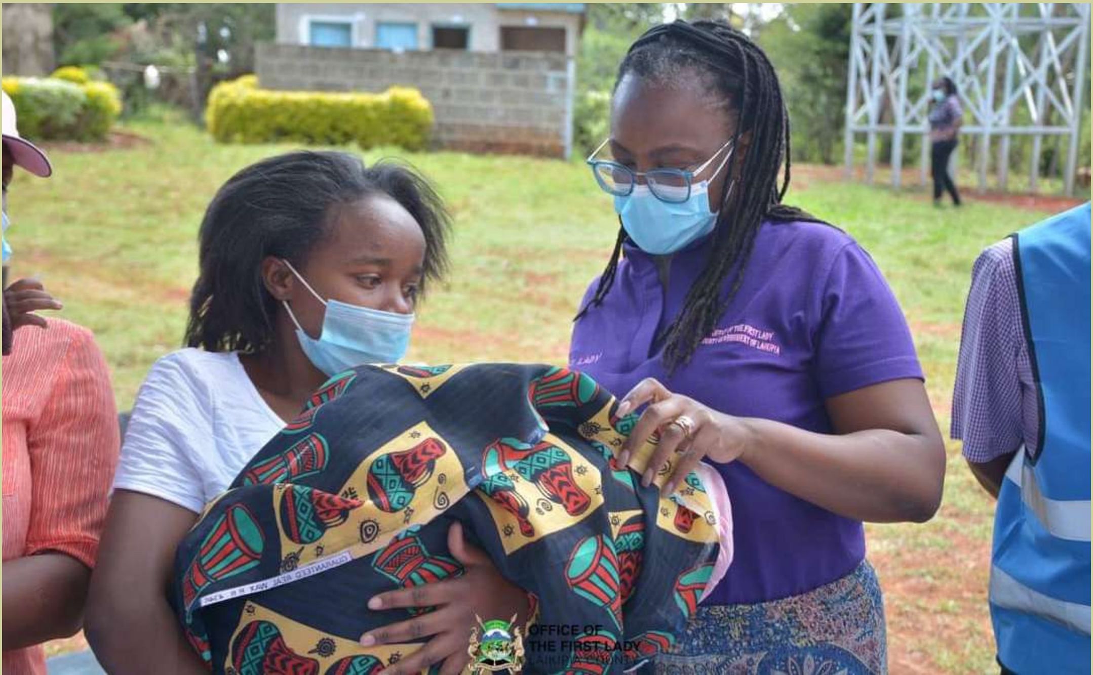
First lady engaging with mothers at mahianyu dispensary and LHS Salama Health Centre during the Hongera Mama Kit event