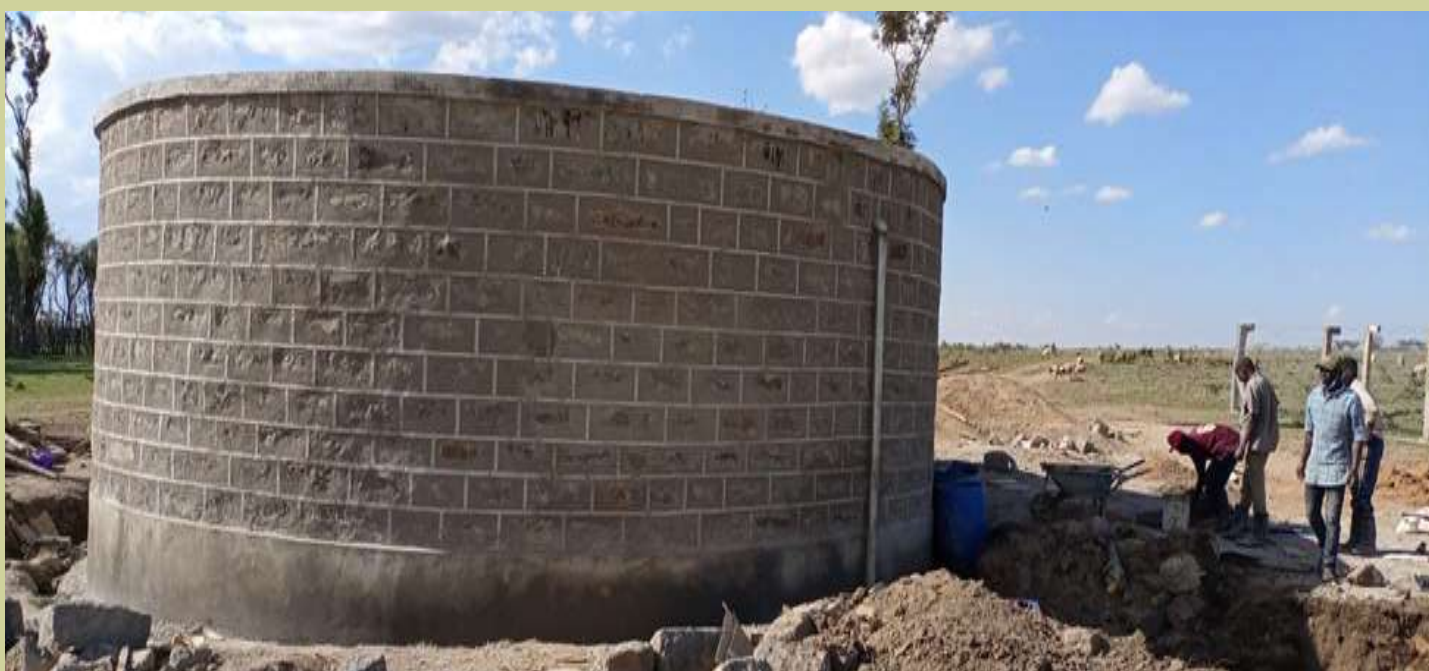
Mutirithia Masonry Tank

The dairy sector is expected to increase milk production from the current 5 litres per cow per day to 15 litres as there will be improved pastures in the area.