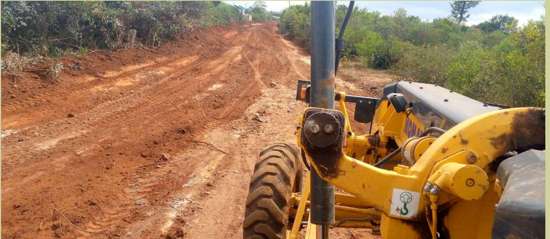
Grading of a road in Ol Moran ward under the leasing programme