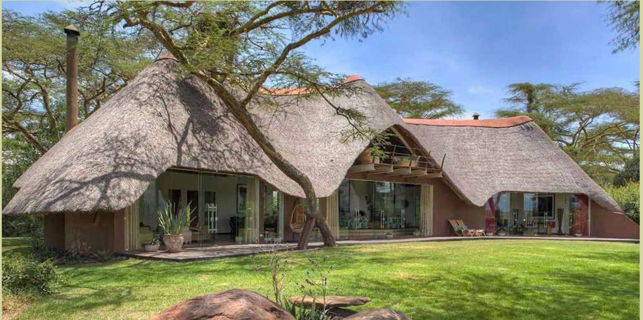
A Lodge at Solio Ranch