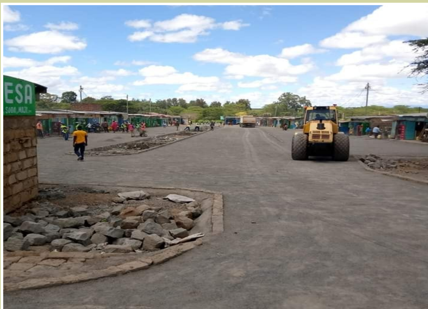
The new Rumuruti Town Bus Park is nearing completion

New high rise buildings are fast replacing old ones, as demand for residential and commercial spaces drive up construction activities. Smart Towns Initiative is a programme supported jointly by the national government and the World Bank through the Kenya Devolution Support Programme, KDSP.