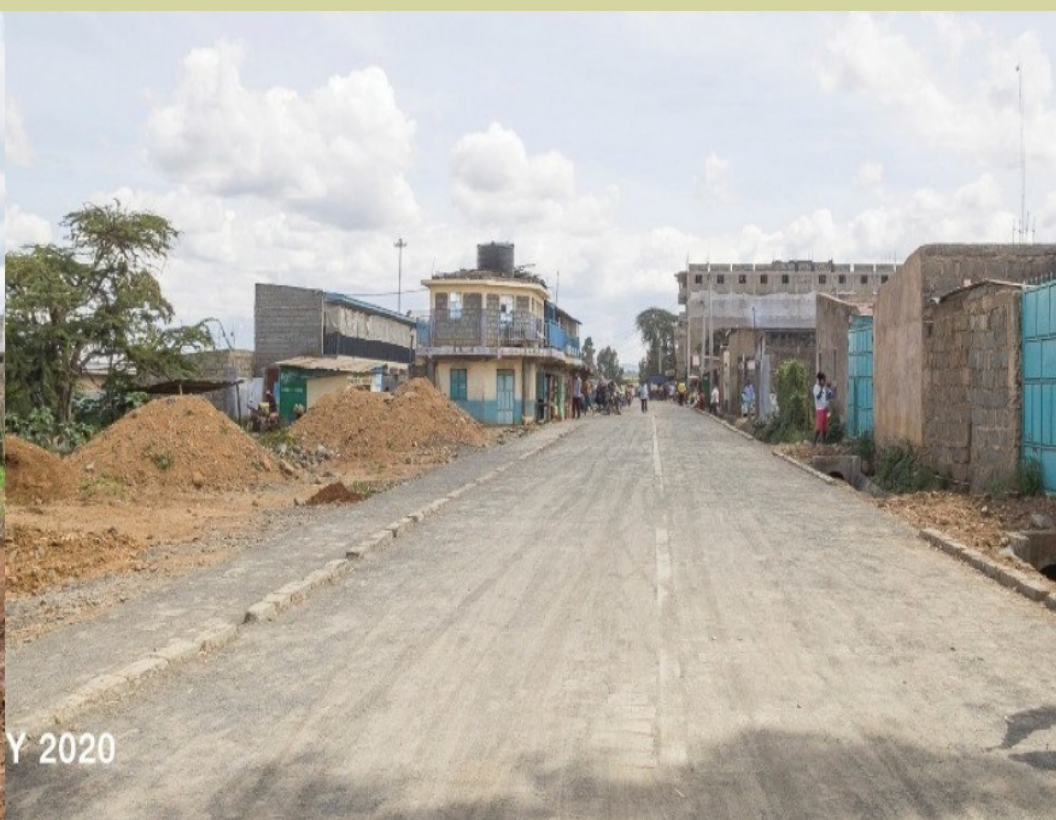
Ongoing road works that have given Rumuruti Town a new look

T he face of Rumuruti town is rapidly changing, thanks to the transformative agenda of Laikipia County Smart Towns Initiative.