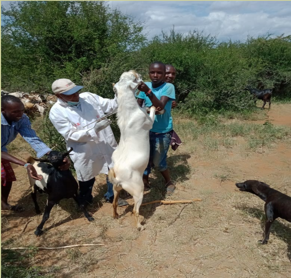
Free livestock vaccination exercise in Laikipia North

The County Government of Laikipia has embarked on a free livestock vaccination campaign to protect thousands of animals from highly contagious diseases. The vaccination campaign targets to protect the communities that entirely dependent on livestock from economic damage as a result of mass stock deaths caused by the preventable diseases. The County veterinary teams have successfully vaccinated 20,000 cattle against the Foot and Mouth Disease, 27,000 goats against CCPP, (a highly contagious disease that affects goats), with 48,000 sheep and goats getting vaccinated against PPR disease, (a plague that affects sheep and goats). The recent campaign was started in the wards of Sosian, Mukogodo West and Mukogodo East where majority of the stocks are found, as the campaign is set to be rolled out across more wards. So far, over 4,000 people in 699 households in the three wards have benefitted from the free livestock