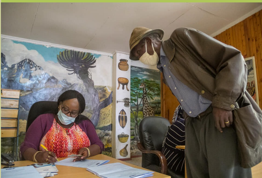
An officer attending to one of the beneficiaries of County's Imarisha Afya Programme

T he County Government of Laikipia has rolled another phase of health insurance payment to benefit over 12,000 families who have been found not to be able to afford insurance cover.