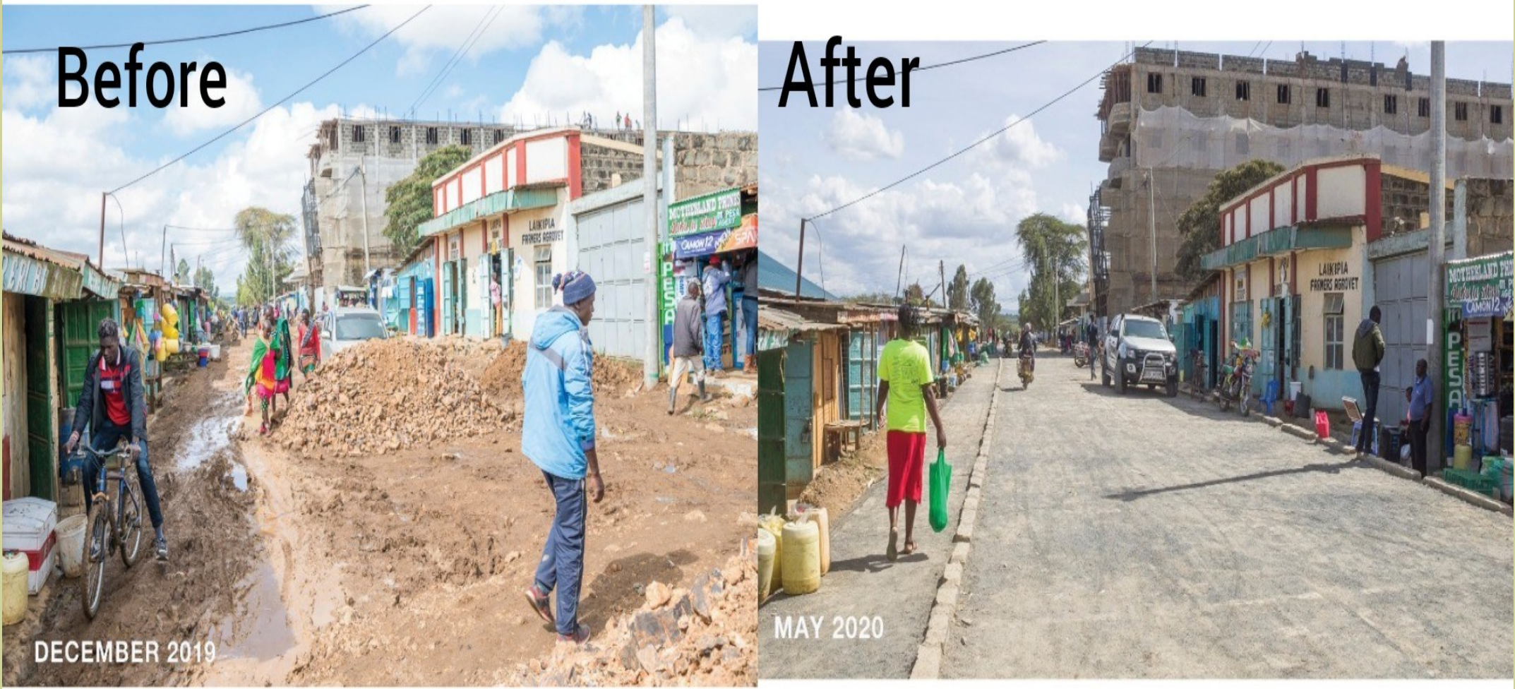
A street in Rumuruti showing before and after receiving a facelift

assembly on time, preparation and submission of quarterly financial reports to the county assembly and copies to the Controller of Budget, National Treasury and CRA, proper use of all the 25 procurement IFMIS steps Fund from KDSP in the previous ranking was used to finance some of the he following projects; construction of X-Ray Block in Rumuruti Hospital, Smart Town Initiative, improvement of Ndemu Dispensary, grading and gravelling of road to Doldol Hospital, improving Kiwanja Ndege water storage, Mugumo Water improvement and Suguroi water improvement. In the second grant that will be received as a result of the high performance, Laikipia plans to utilize the money to implement the following proposals on projects: Improvement of Nanyuki Market to a better standard, focus on Kinamba Water distribution, and improve Mukurian Water distribution.