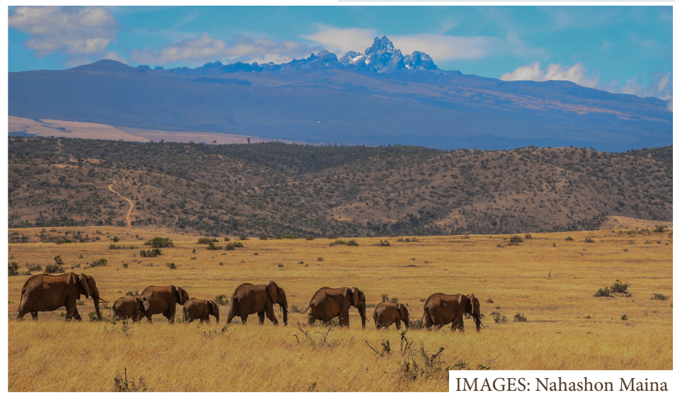
A view of Mt. Kenya landscapes from Borana conservancy

ince July 2022, Borana conservancy has been running an education programme dubbed "Mazingira Yetu" that engages the neighboring communities to broaden, deepen and inspire their understanding of conservation.