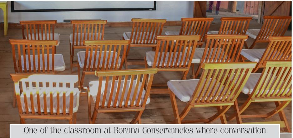
discussions are conducted.