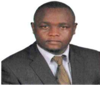
BIWOTT TIROP CECM TRADE, TOURISM, CO-OPERATIVES AND INDUSTRIALIZATION